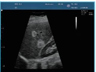
Spatial compounding and speckle reduction enhance contrast resolution to clearly delineate hepatic lesions