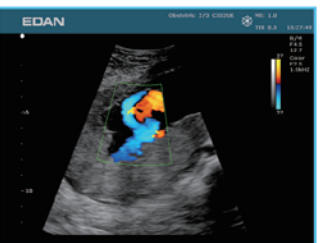
Hemodynamic information is clearly seen in this second trimester umbilical cord