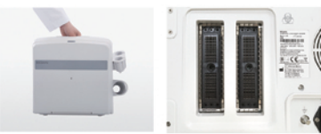
Two Transducer connectors, active and exchangeable.

Whether your imaging study requires unparalleled detail and contrast resolution for high frequency musculoskeletal imaging or superb penetration to evaluate deep abdominal targets, the suite of transducer optimized for the U50 Prime Edition ultrasound system ensures you can scan more patients, across more applications, with more diagnostic confidence. Characterized by a compact, lightweight design and user-centric workflow, the U50 Prime Edition meets the need for a highly portable and easy-to-use ultrasound system.