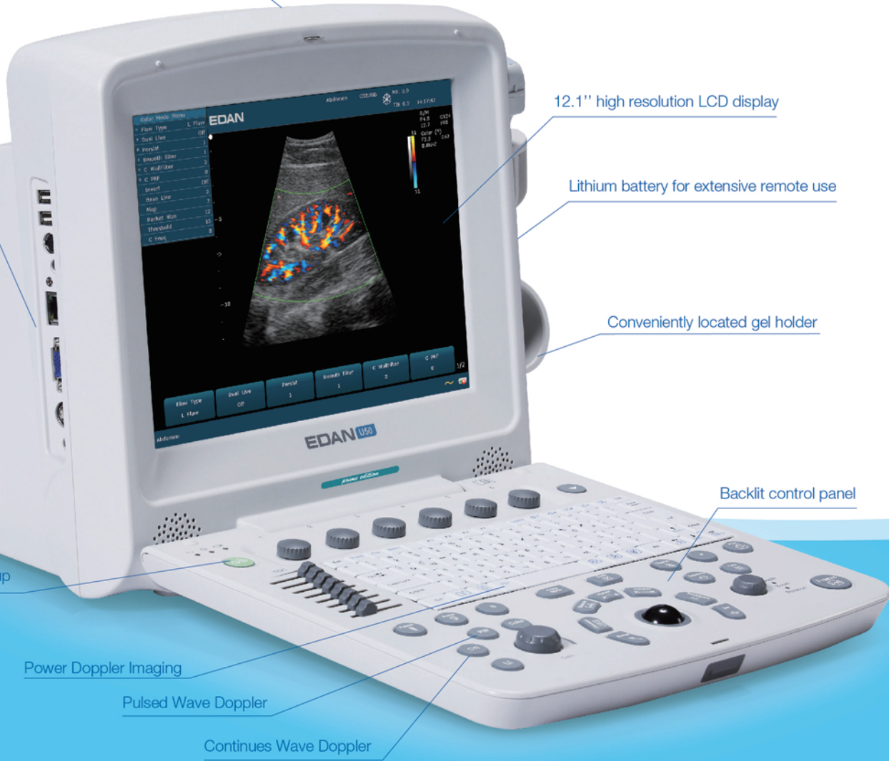
Large capacity integrated hard disk for extended data storage