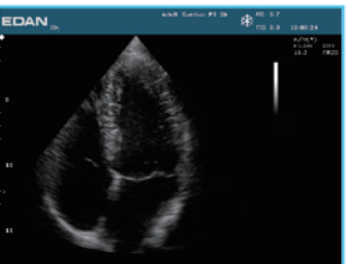
Harmonic imaging produces excellent myocardial border definition.