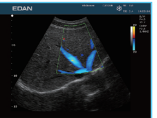
Superb color Doppler spatial resolution aids in rapid interrogation of the hepatic veins