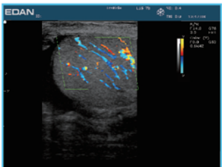
High frequency imaging provides the sensitivity necessary to display normal testicular flow.

From superb image quality to the streamlined user interface, the U50 Prime Edition ultrasound system is designed to give you more diagnostic information across target applications than similarly priced competitive systems. Advanced 2D and color Doppler imaging technologies you'd expect to find only in premium-priced systems are standard. The portable U50 Prime Edition system delivers the performance of a high-end system at a compact price.