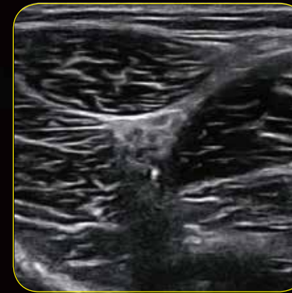
Sciatic Nerve Pop