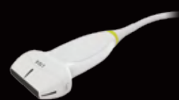
5 - 12 MHz Linear Array